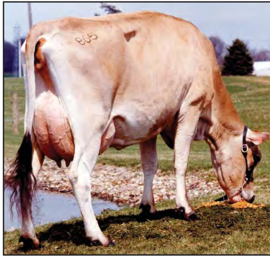
YELLOW ROSE FELINA BELLE-ET, VG-89% GREAT-GRANDAM OF LOT 6