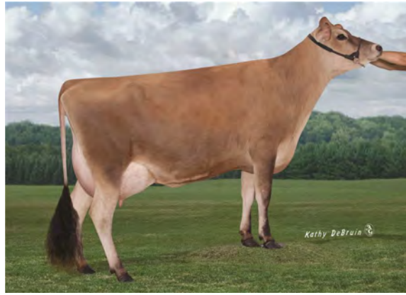
DODAN LH VISIONARY TESSA, E-90% SISTER TO THE DAM OF LOT 1