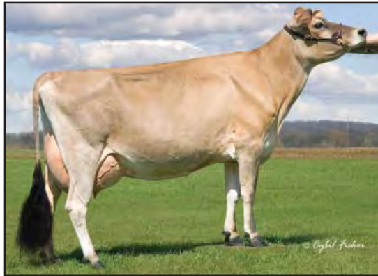
MICHAEL CENTURION DARLA, E-93% GRANDAM OF LOT 104G