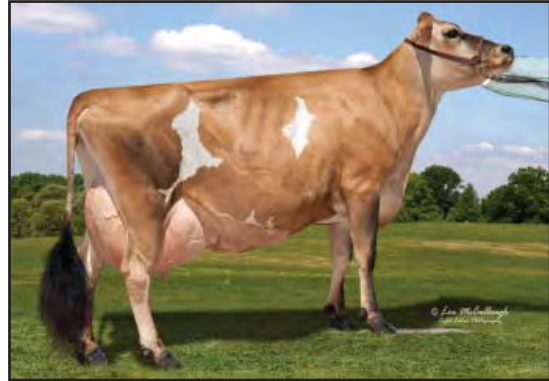
HEARTLAND NATHAN TEXAS-ET, E-95% GRANDAM OF LOT 3