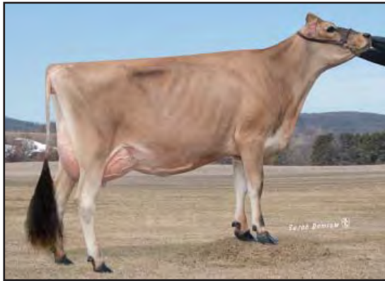
JX BELLWOOD GOLDA SAVOY {4}, E-91% DAM OF LOT 7