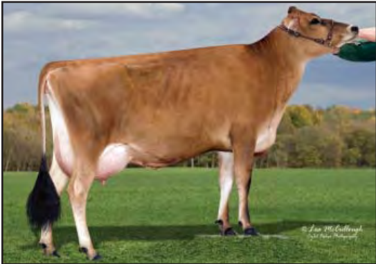
HEARTLAND JIMMIE TUSCON-ET, E-91% SISTER TO THE DAM OF LOT 3