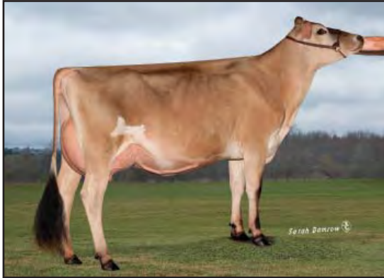
ALL LYNN'S IRWIN TRISTA-ET, VG-85% SELLING AS LOT 3