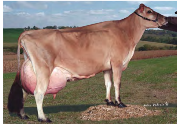
NORSE STAR JUDE BERRY, E-92% GREAT-GRANDAM OF LOT 104E