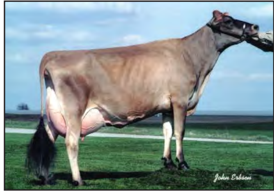
BUTTERCREST ROCKET SNAP, E-91% FOURTH DAM OF LOT 7