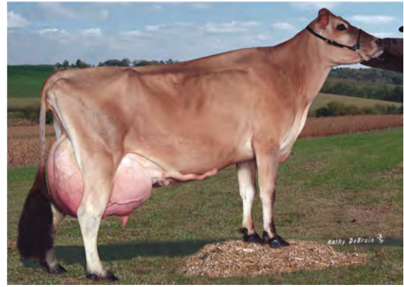
NORSE STAR JUDE BERRY, E-92% FIFTH DAM OF LOT 104D