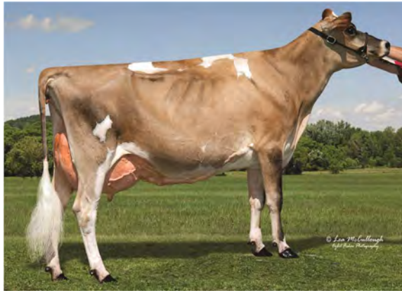
SRG ROYAL GANNON ELLE, E-92% SISTER TO LOT 2