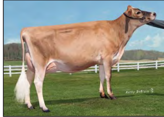
ALL LYNN IRWIN TABITHA-ET, VG-87% SISTER TO LOT 3