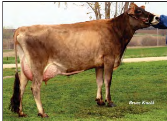
HEARTLAND MANNIX TYME, E-92% FOURTH DAM OF LOT 3