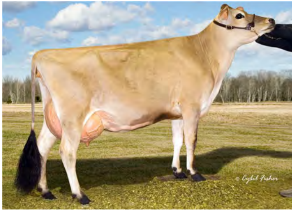
NORSE STAR FUROR BEAUTY, E-91% SISTER TO THE GRANDAM OF LOT 104E