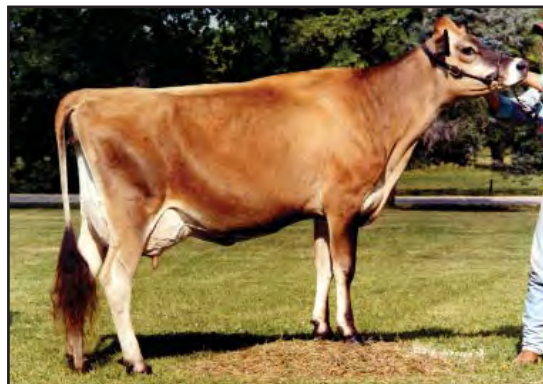
RUDOLF BELLE, E-91% FOURTH DAM OF LOT 6