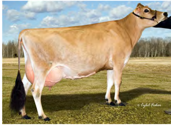
MILK-N-MORE PARAMOUNT JENNI, VG-89% SISTER TO THE GRANDAM OF LOT 104C

BUYERS MAY SELECT 10, 11, OR 12 COWS FROM LOTS 104A TO 104L