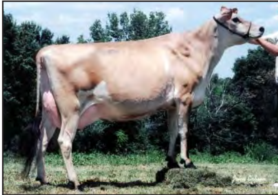
CENTURION DC DELLA, E-90% GREAT-GRANDAM OF LOT 104G