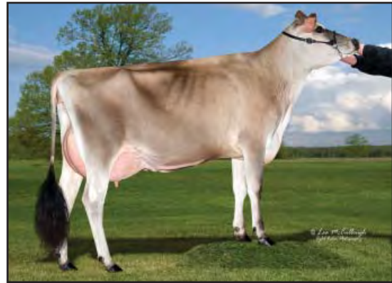
BELLWOOD CELEBRITY SASSY-ET, E-92% GRANDAM OF LOT 7