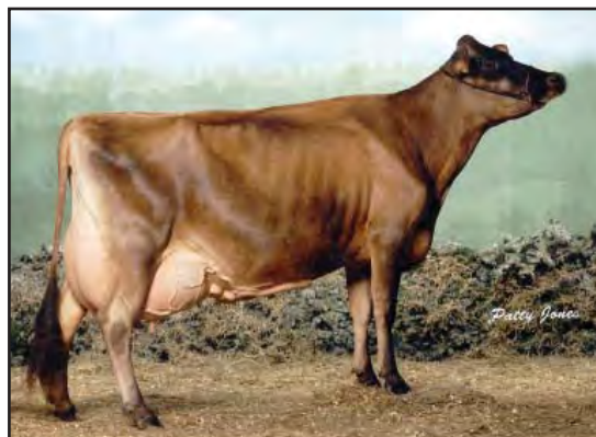
DUNCAN BELLE, E-92% 7TH DAM OF LOT 6