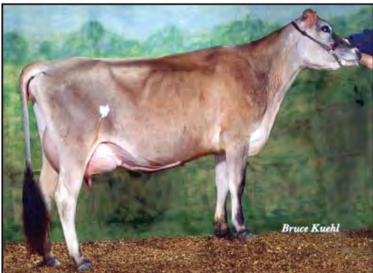
HEARTLAND MOR TULSA, E-90% GREAT-GRANDAM OF LOT 3