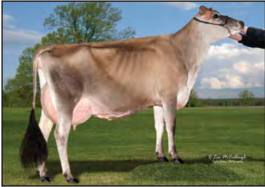
BELLWOOD CELEBRITY SATIN-ET, E-90% SISTER TO THE GRANDAM OF LOT 7